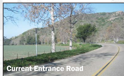
Current Entrance Road

The monies would also be used to develop planning and engineering designs for the entrance road that will be required when the Lewis road expansion from two to four lanes is completed.